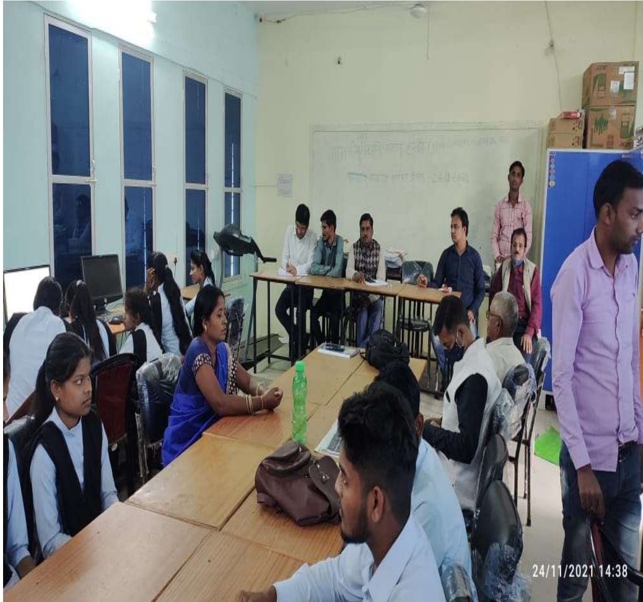
Computer Education for students and Staffs

Affiliated to Shaheed Nandkumar Patel Vishwavidyalaya, Raigarh